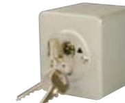
Universal key switch